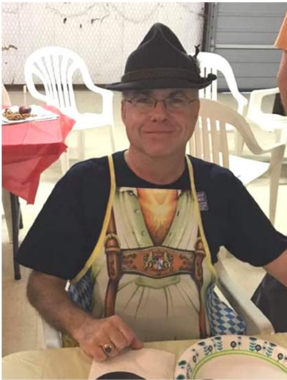
Getting into the spirit of the “Fest” theme.