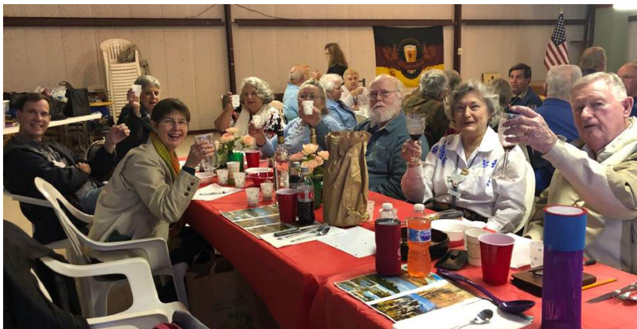
Below: Very willing wine tasters.