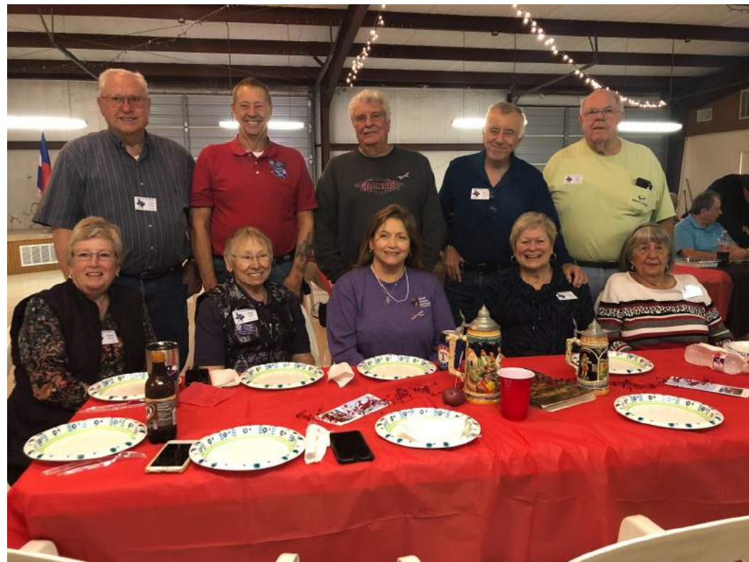
Heart of Texas members after decorating their table for our JanuaryFEST theme.