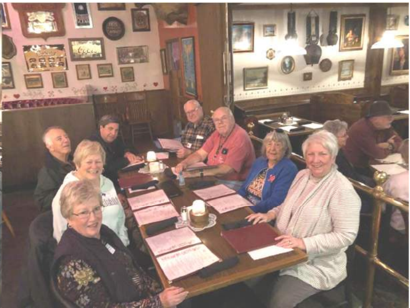
For Thursday night dinner folks went to different restaurants then gathered back as a group to hear restaurant reviews—the good, the bad, and the delicious.