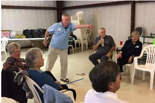
And games. Always games.....