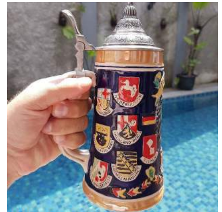
Notice the beautiful beer steins.

The word "stein" is of German origin. The etymology of the word is either from "Stein Krug" (meaning stone jug/mug) or from "Steingut" (meaning stone goods). Steins are mugs used for drinking beer. They can be made of earthenware, pewter, wood, ceramics, crystal, porcelain, creamware, silver, or glass. They have a handle and a hinged lid; are decorated and sometimes hand-painted.