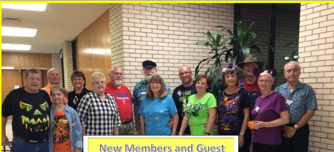
New Members and Guest at the October Rally