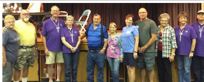
Longhorn RV Center in their new location. Very Nice !