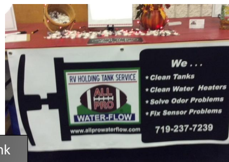
Gray Tank and Black Tank Seminar