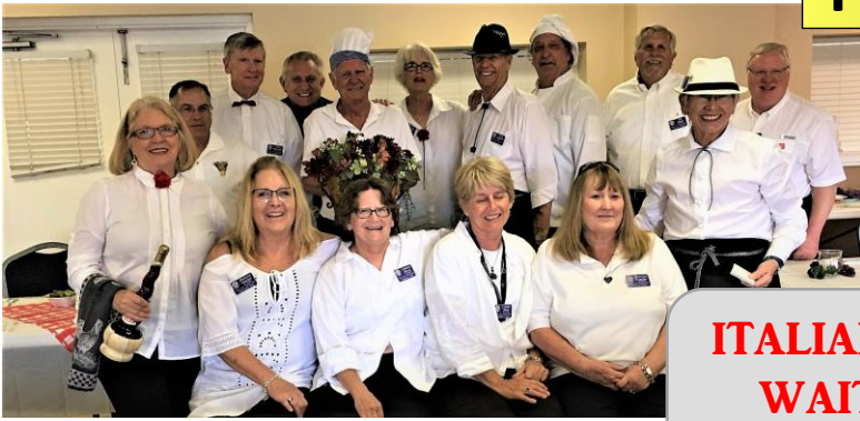
ITALIAN DINNER WAIT STAFF AND CHEF