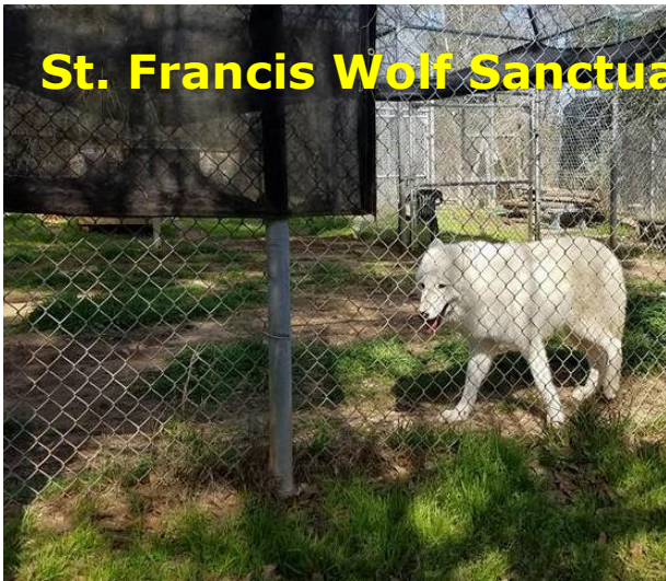
St. Francis Wolf Sanctuary