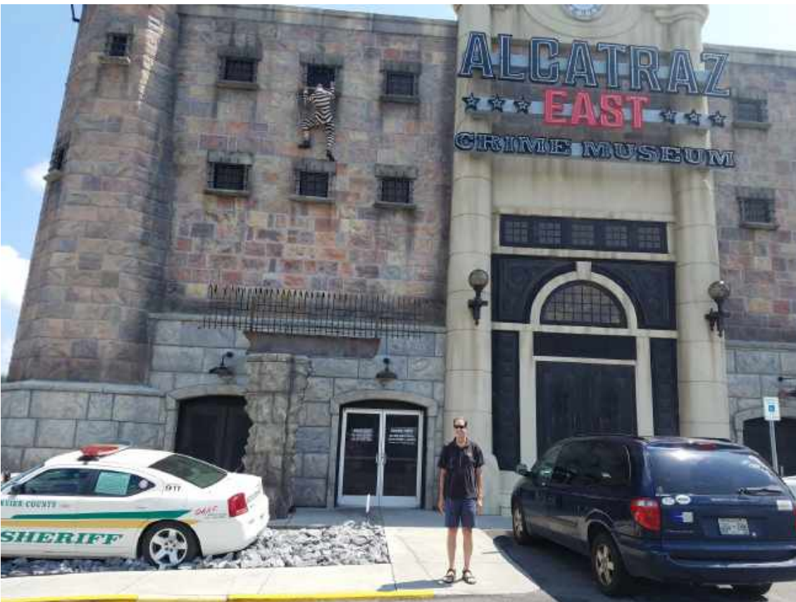
If you are a crime buff, don't miss Alcatraz East Crime Museum in Pigeon Forge TN.