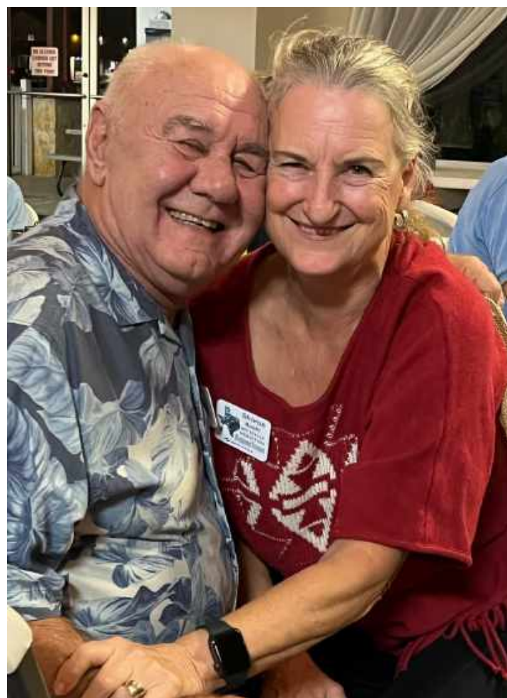
More happy campers