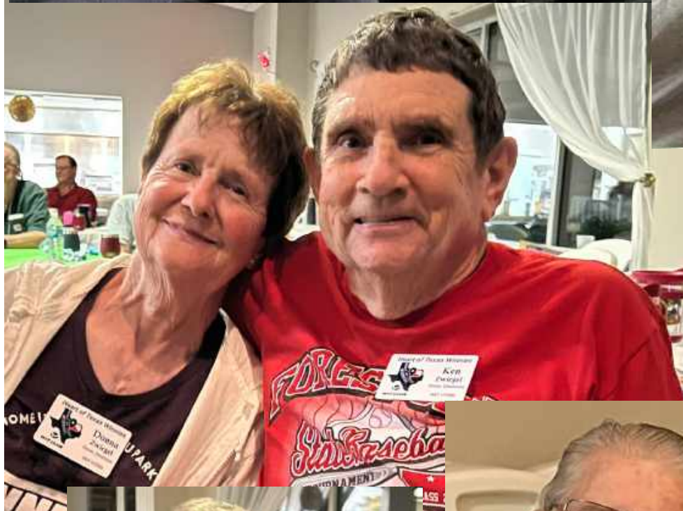
Happy Texas W members