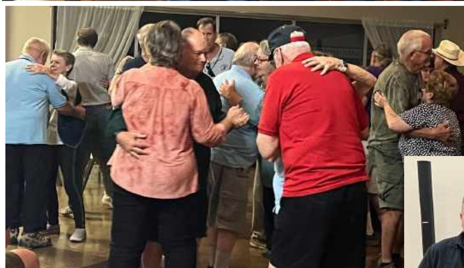
A little dancing to the tunes of Touch of Gold