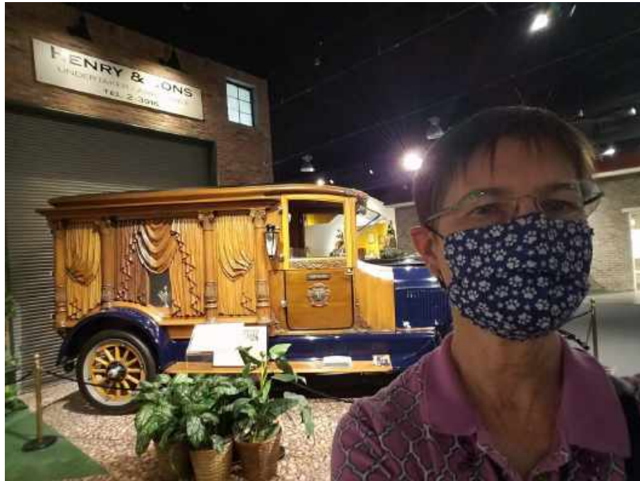
One of the elaborate hearses on display at the National Museum of Funeral History in Houston TX.