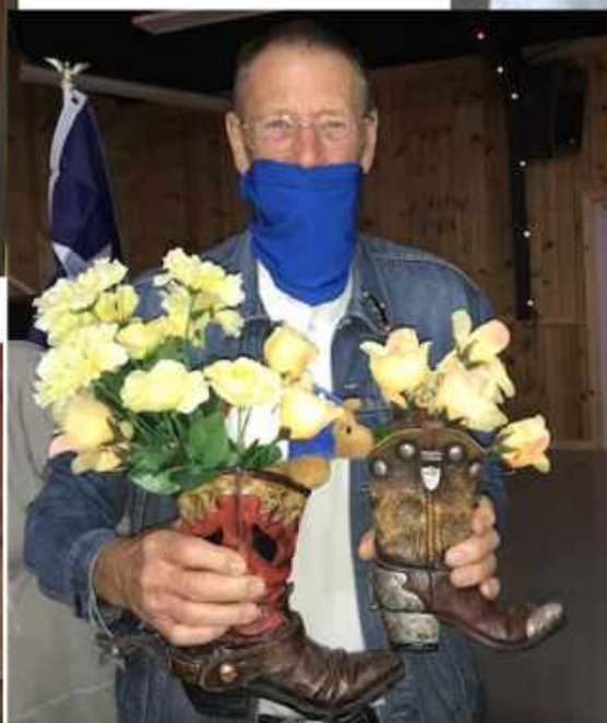
Boot decorating contest entries