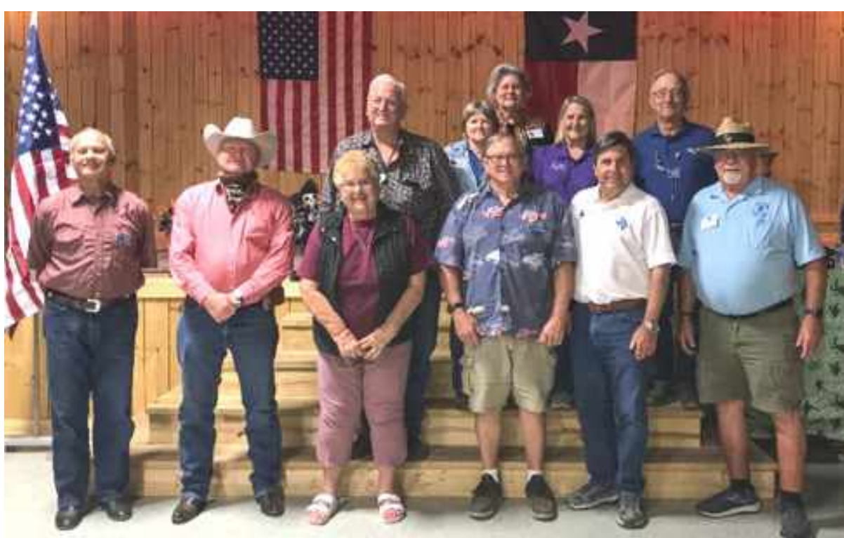
Bean Bag Baseball Winners