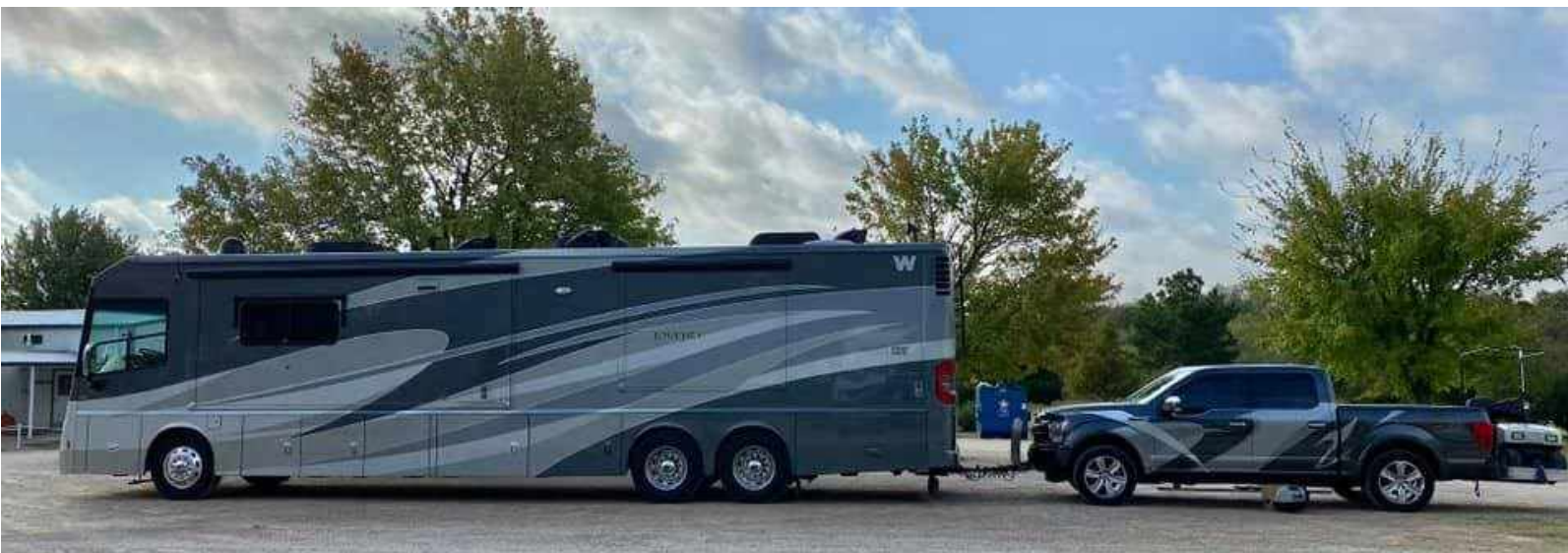
Terry & Carolyn Hughes debuted their newly wrapped 2020 Ford F150 pickup that now matches their RV thanks to Texas Truck Works