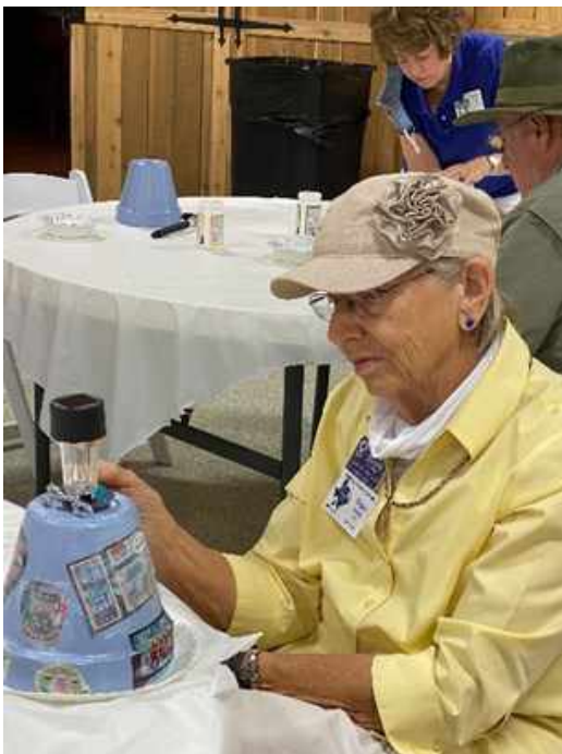
Happy Camper Craft