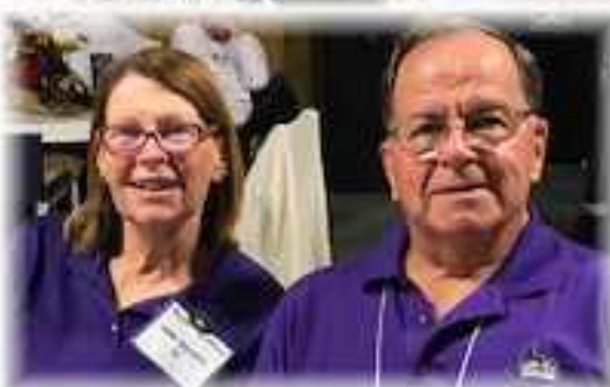
Some of our cute couples