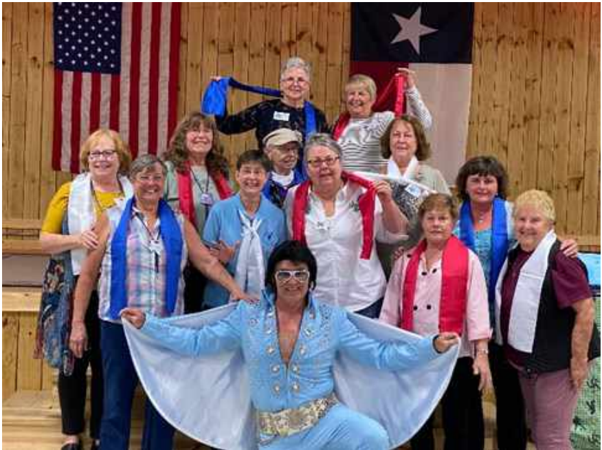
Above: Elvis and his Girls!